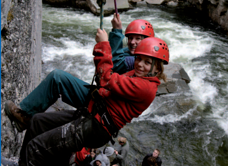
Rappelling down the longest water-filled canyon in North Europe – one of the adventures in Vilseledaren.